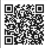
LEARN ABOUT THE AUTHORS OF OUR PARISH COMMUNITY

Today at Mass, when the host is elevated and you hear John's words again—"Behold the Lamb of God!"—take a moment to savor these words anew. ●